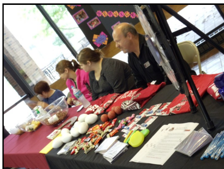
S.S.S. Welcome Back!

Good Luck with your final exams, projects, and papers as we wrap up fall semester 2011. If the SSS Staff can assist you with any of your academic needs, please let us know. Happy Holidays and best wishes in the new year to you and your family!