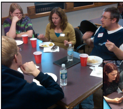
S.S.S. students hanging out at the fall get-together.