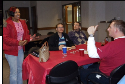
Students hanging out at the S.S.S. Holiday Party.